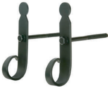
Traditional Rat Tail Stay