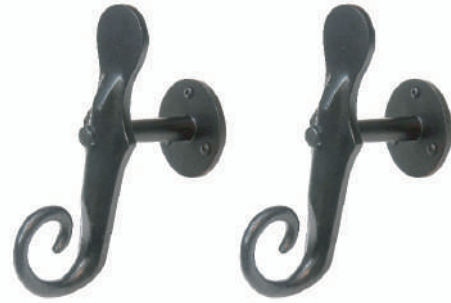
Protruding Rat Tail Stay – Plate Mount