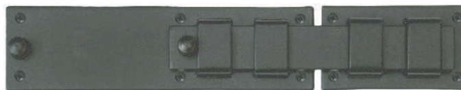
Traditional Slide Bolt