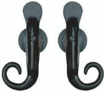
Flat Rat Tail Stay – Plate Mount